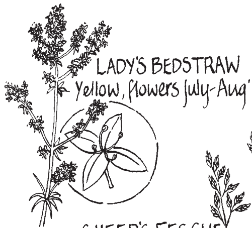
LADY'S BEDSTRAW Yellow, flowers July-Aug'