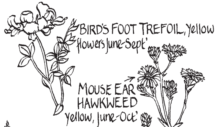
BIRD'S FOOT TREFOIL, yellow flowers June-Sept'