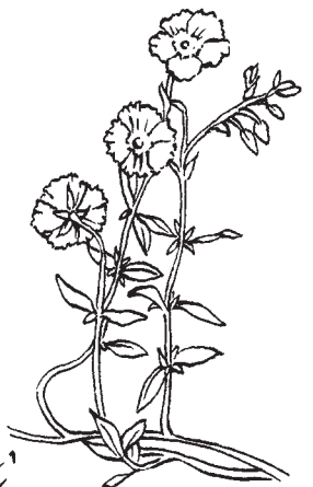
COMMON ROCK-ROSE Yellow, flowers June-Sept'