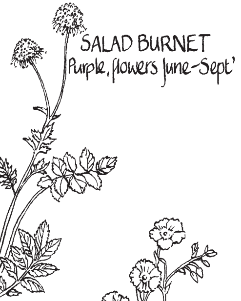
SALAD BURNET Purple, flowers June-Sept'