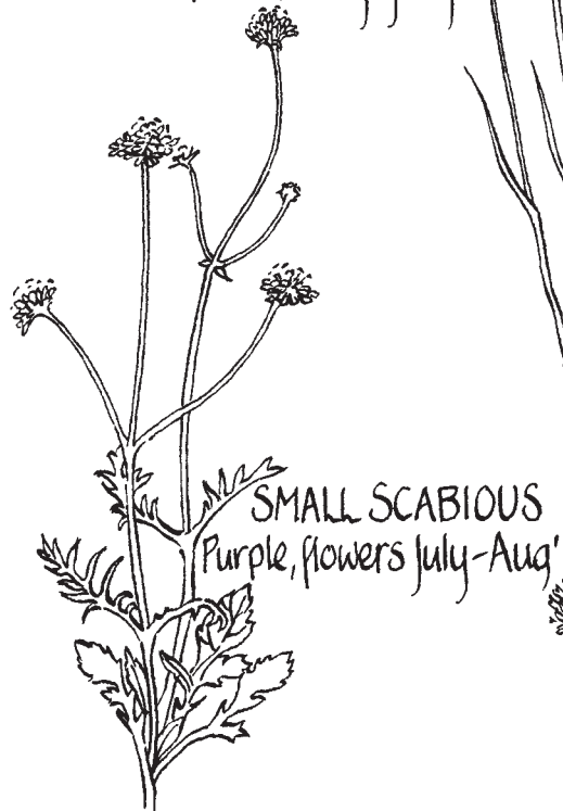
SMALL SCABIOUS Purple, flowers July-Aug'