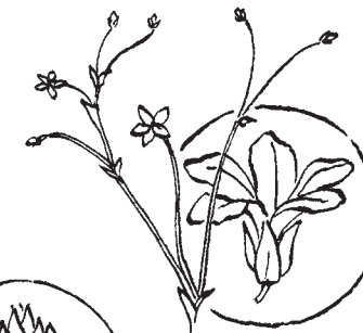
FAIRY FLAX white, flowers June- Sept'