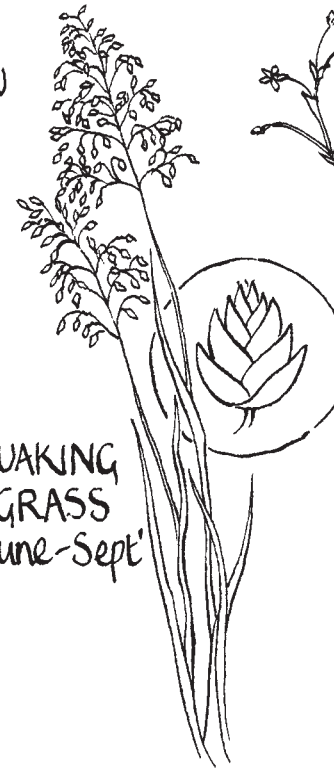
QUAKING GRASS June-Sept'