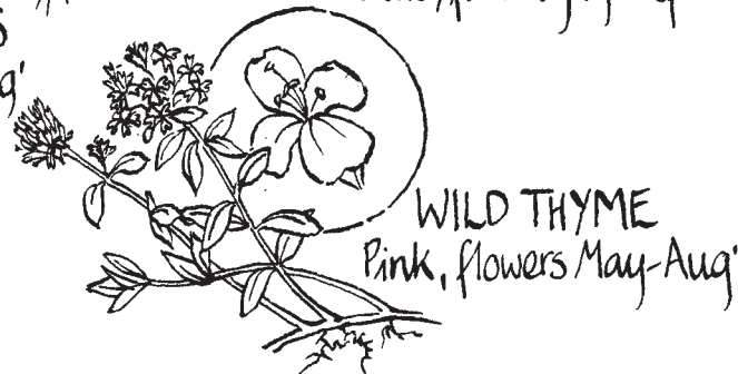
WILD THYME Pink, flowers May-Aug'