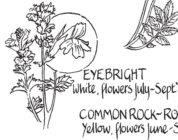
EYEBRIGHT white, flowers July-Sept'